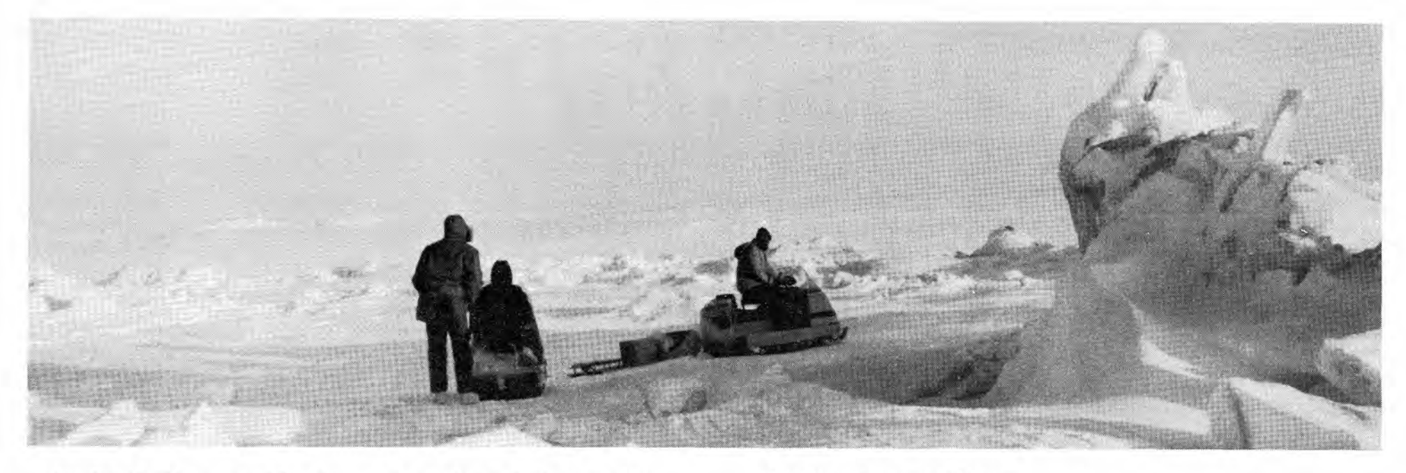
SANDIANS ride snowmobiles through a rough ice field near Alert, Canada, to mark a target zone for ice penetration tests.